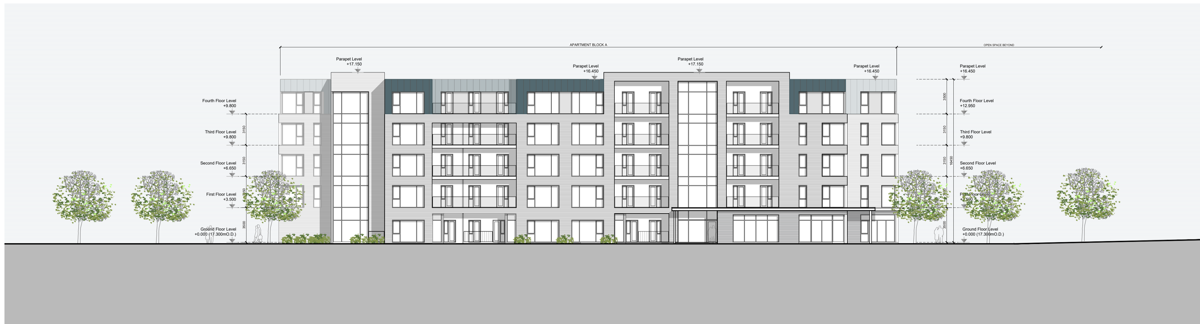
West Facing Elevation DD CHARACTER AREA 2