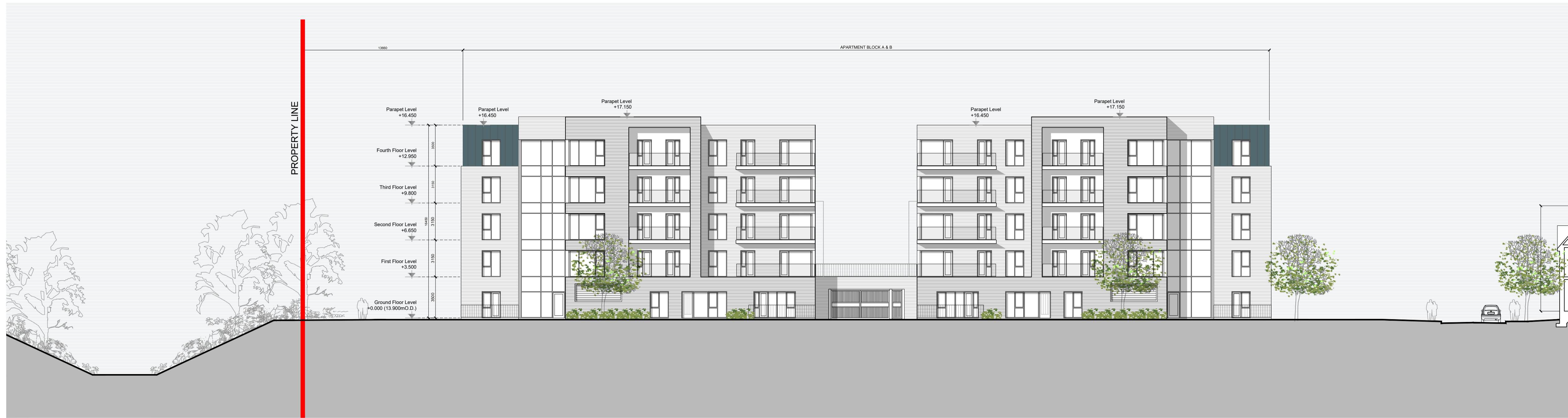
North Facing Elevation CC CHARACTER AREA 2 (Chailey Stock Brick)